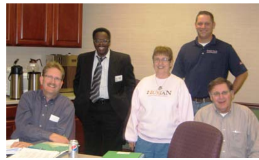
THE BOARD AND STAFF ARE INVOLVED IN UPDATING AURORA'S STRATEGIC PLAN THROUGH A CAPACITY BUILDING GRANT FROM THE TOLEDO COMMUNITY FOUNDATION.

LEADERSHIP TOLEDO SELECTED AURORA AS A PROJECT FOR THEIR 2009-2010 CLASS. A GROUP OF FIVE MEMBERS WILL CREATE MARKETING PIECES FOR AURORA INCLUDING A NEW WEBSITE DESIGN, STORY BOARD, AGENCY BROCHURE, AND DVD.