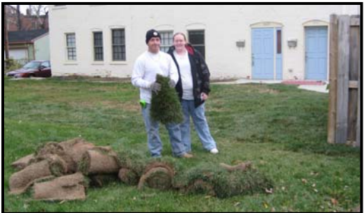
Toledo First 7th Day Adventist Church provided sod for the Aurora side lawn.