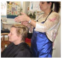
TOLEDO FIRST 7TH DAY ADVENTIST CHURCH PROVIDED A SPA DAY FOR AURORA